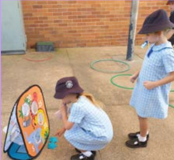
Bean Bag Toss